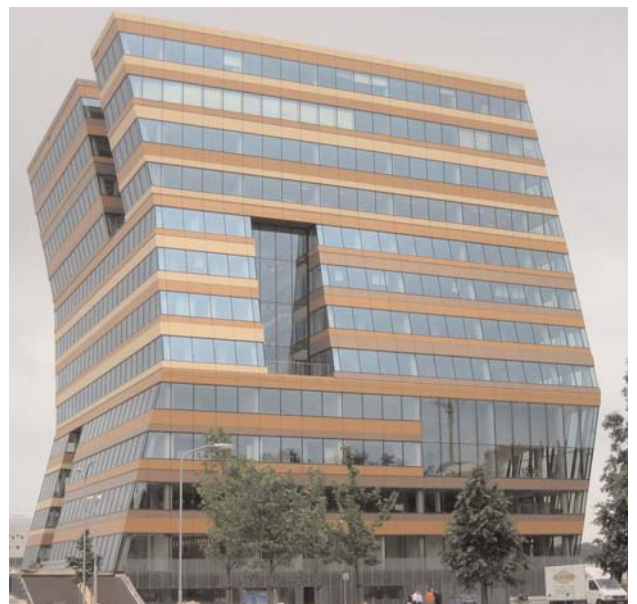
Menzis relocates to a new premises.